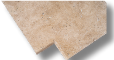
L Shape Corner